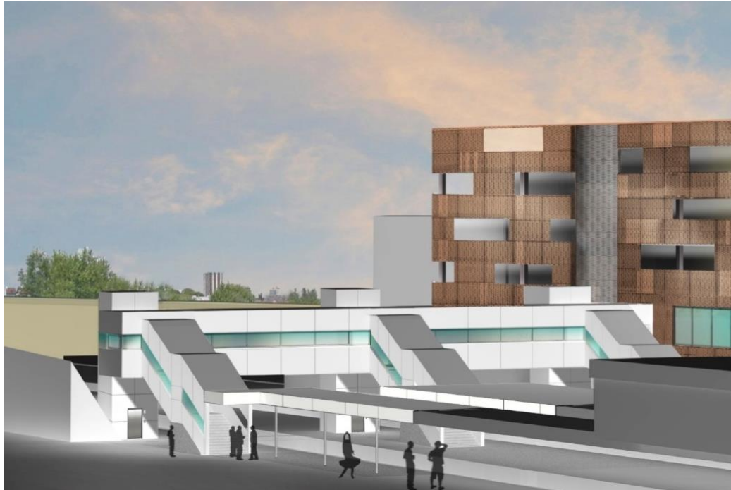
Option A Original Footbridge & Canopies Design